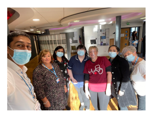
The team of staff and volunteers at Haslucks Green surgery on 1<sup>st</sup> October.

Many, many thanks to the fourteen PPG volunteers who covered the flu clinic on Saturday 1<sup>st</sup> October. Your support was much appreciated by all staff and ensured that the whole process worked smoothly for patients. A new rota for the next walk in clinic on 22 October will be circulated via the PPG membership database. Many thanks in advance!